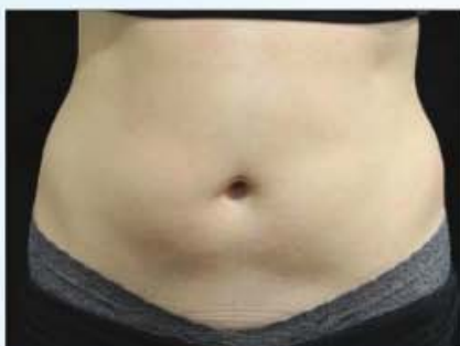
One week after first BTL Vanquish ME Tx