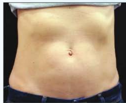
One week after third BTL Vanquish ME Tx