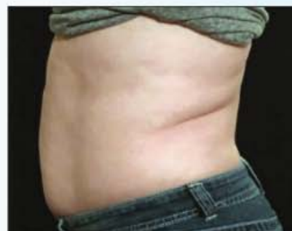
Six weeks after four BTL Vanquish ME treatments