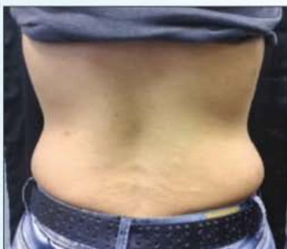
Four weeks after four BTL Vanquish ME treatments