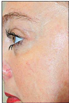
After two Exilis Ultra treatments