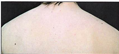
After four BTL Exilite treatments