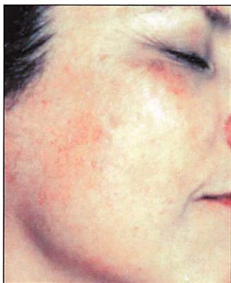
After three BTL Exilite treatments