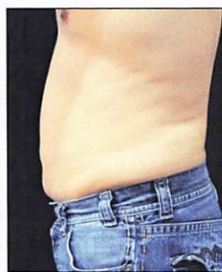
After Vanquish and Cellutone combination Tx

affordable treatment time make it a very successful platform for body shaping, skin tightening and wrinkle reduction.”