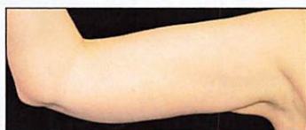
After four Exilis Ultra treatments