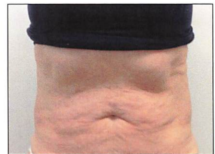
After Vanquish and Cellutone combination Tx