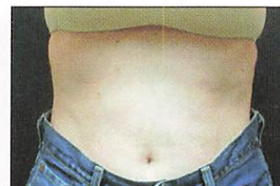
54 year old patient before and after five sessions of BTL Vanquish ME and Cellutone given one week apart

comfort of Body By BTL devices makes this easier.”