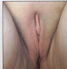
Before and immediately after one ULTRA Femme 360 Tx