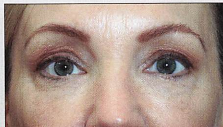
Before and four months after two BTL Exilis ULTRA treatments